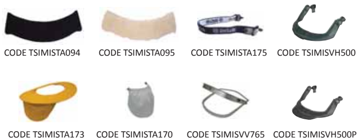
CODE TSIMISTA094 CODE TSIMISTA095 CODE TSIMISTA175 CODE TSIMISVH500 CODE TSIMISTA173 CODE TSIMISTA170 CODE TSIMISVV765 CODE TSIMISVH500P